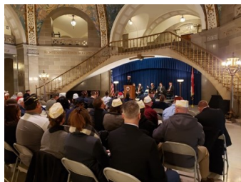
MAVO Rally at Missouri Capital 26 January 2022

I had the opportunity to attend the Missouri Veterans Commission and MAVO meeting in Jefferson City on 25 Jan 2022. There was a MAVO Rally on 26 January 2022 in the Rotunda in the State Capitol to bring awareness and discuss with our State Legislators the importance of a fully funded Missouri Veterans Commission (MVC). The funding includes operation and maintenance of State Veterans Homes, State Cemeteries, Veteran Service Officers Program and Veterans Grant Programs. Our Missouri Veterans Homes (7) are at 50% capacity due to staff shortages (CNA's, LPN's and RN's) and the underfunding of our Medical Professionals in Veteran Facilities. Our Veterans deserve better. This reiterates the importance of one of our core programs: Nurses Training.