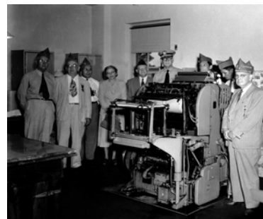
40 & 8's Presenting Printing Press in 1947