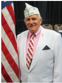
The Grand Chef