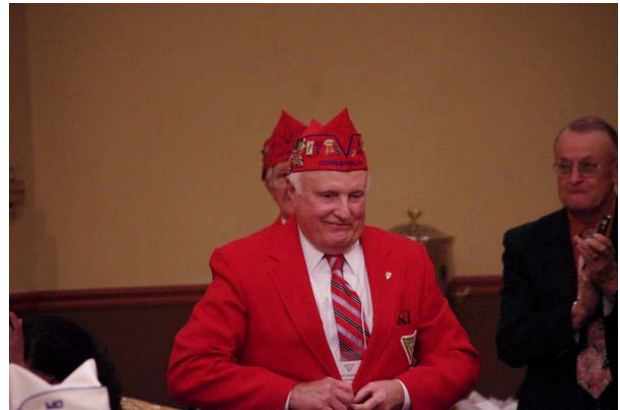
Distinguished Voyageur of the Year 2011