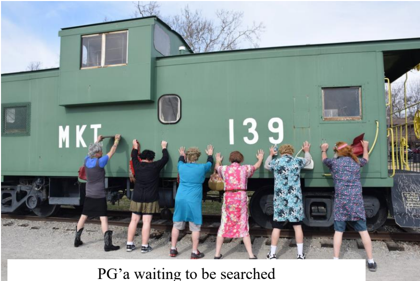
PG's waiting to be searched