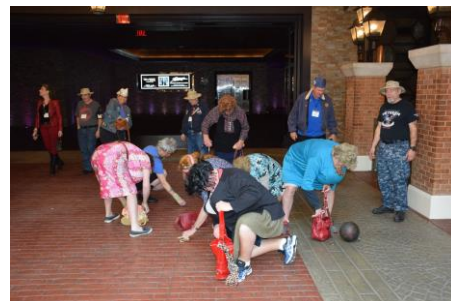
PG's picking up penny's at the Casino