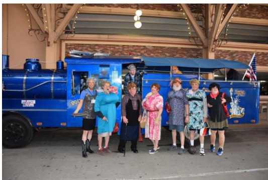
PG's with old blue