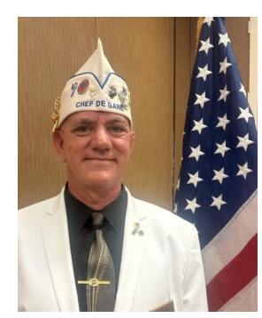
Greetings Fellow Voyageurs,

I have been quite busy last month gearing up for the Grande Wreck and yard work. I have had conversations with several voitures that this Spring Wreck should be a good one. We are expecting to have several NEW P.G.'s to test and hopefully they make it through earning their "Voyageur Militaire" bar for the marching medal. Good Luck to all of you, and can't wait to meet you.