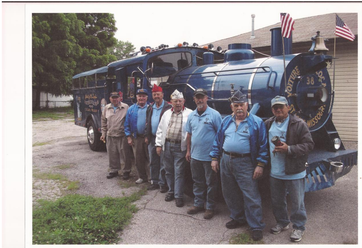
Voiture 38 Locomotive and its Crew