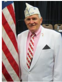
The Grand Chef