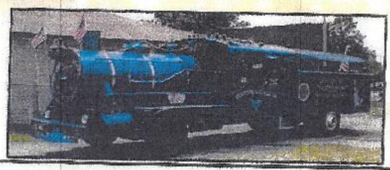
Summer Barbernes of Voiture Locale Wo. 38 (United States Armed Parces Veterans)

"Your patronage supports our work in many Community Outreach Programs"