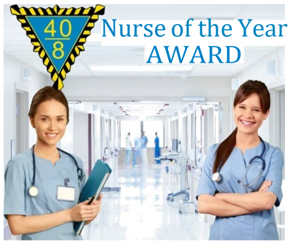
Our organization, an elite veterans' honor society with roots dating back to 1920, has a long-stsndmg commitment to supporting the health of one nacion through our nurses' trailrfing program. S = £gg£, we have awarded cnunHess scholarships to aspiring nursing studunW and annoy rucognmv as ouHtnnding individual as "Turn of the Year.' We invite you in nominate a 6eaeNng nurse te'day.

Attention all Locale Directeurs reports are due to Grande Directeurs by June 15, 2025