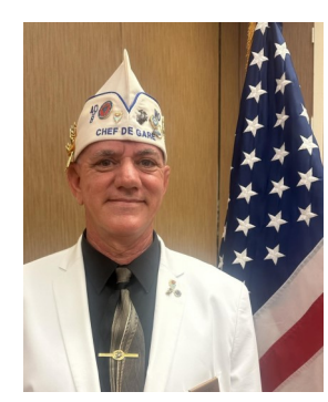
Greetings Fellow Voyageurs,

As my time is winding to a close soon, I would first like to say I have really enjoyed my time as the Grand Chef de Gare du Missouri. The reason for the enjoyment I have had is 100% the members that we have here in Missouri. Visiting a good number of the Voitures, and I have a few more on the list, is exciting. Meeting those individual voyagers that don't always make it to the Grand functions but are the "Backbone" to their locals are an important reason the 40 and 8 survive. I would personally like to thank each and every one of you. Even if we have not met or missed each other in travel. I know you are there. I know you exist and your presence and hard work is appreciated and seen by all.