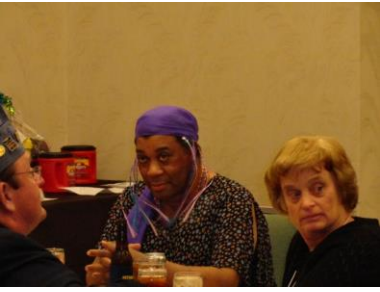
Third place was Voiture 460, who collected $99. Fourth place was Voiture 448, who collected $72.