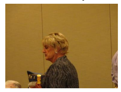
Second place was Voiture 1379, who collected $202.75.

Voiture 1541 took first place with $290 collected