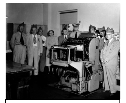
40 & 8'rs Presenting Printing Press in 1947