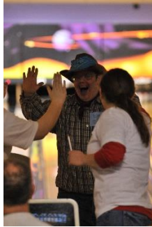
14 th Nov, Chillicothe BOWL area competition, 5 Dec. Kirksville.

Bowling-North Area (SOMO) Nov. 7th St. Joe Southside Bowl KC Metro Area(SOMO)