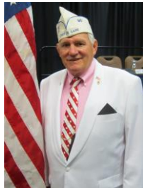
The Grand Chef

Fellow Voyageurs, Another month has passed us by. August has been a busy and productive month for me. I had the privilege to install three more local Voiture's during August. I want to thank all the Voyageurs for their hospitality. It has been an honor to serve the Voyageurs this year as Grand Chef de Gare of Missouri.